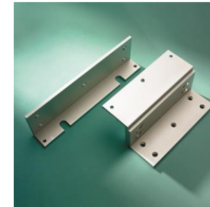
AEMBR089 Z&L Bracket to suit Inward Opening Doors