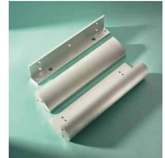
AMH590/ZA Architectural Z&L Bracket to suit Inward Opening Doors